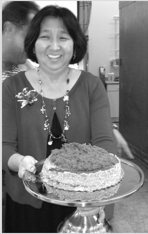
Happy Birthday to...